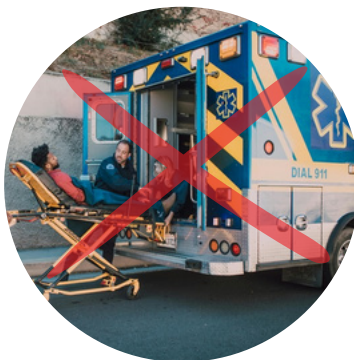
Emergency Medical Transport