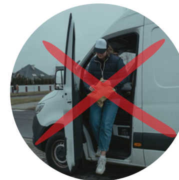
Last Mile Delivery