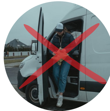
Last Mile Delivery/DSP