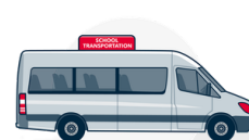
School Transport Minnesota (5 units)