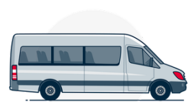
Mini Buses ( < 35 passengers)