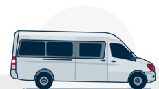
Amish Taxi Pennsylvania (3 units)