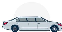
Limo Minnesota (1 unit)