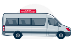
School Transport Ohio (2 units)