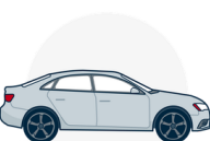
Sedan Minnesota (3 units)