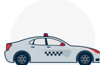
Taxi Virginia (1 unit)