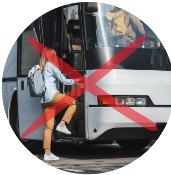
Large Buses (>35 passengers)