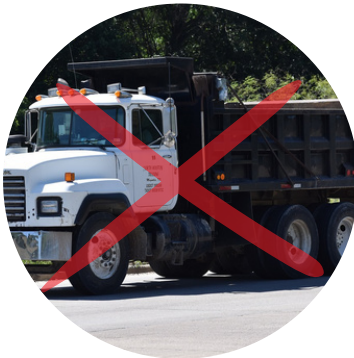
High GVW Vehicles >26K GVW - UW Referral >45K GVW - Never Allowed