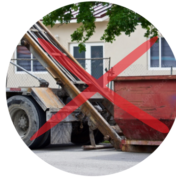
Waste Haulers/Roll-On Trailers