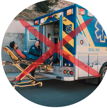
Emergency Medical Transport