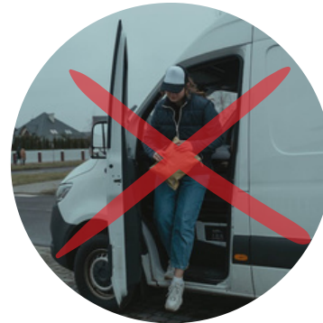
Last Mile Delivery/DSP