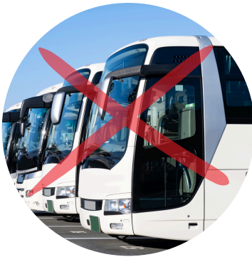
Long-Haul Passenger Transport (Charter Buses)