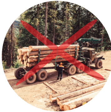
High Hazard Commodities