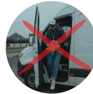
Last Mile Delivery