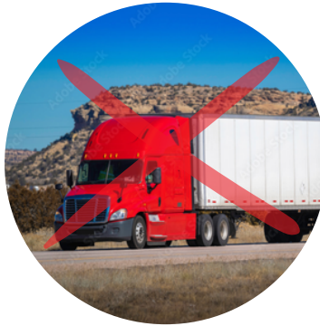
For-Hire Trucking/ Tractor Trailers